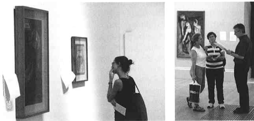
TANIA BRUGUERA is a Cuban artist who divides her time between Havana and Chicago. Her interdisciplinary work focuses on the relationship between art, politics and life. Since 2002 she has been working on a series of projects in which she appropriates structures of power, creating political situations rather than just representing them. Here, BRUGUERA instructed the curators to 'fly post' the Tate Britain galleries with pages from the directive on the return policy for illegal immigrants ( P6_TA-PROV(2008)0293 – the title of the intervention), approved by the European parliament just a few days before the Prologue. In the manner of a protest, the pages covered the rooms and obscured interpretation panels. The intervention was 'activated' by a gallery attendant, employed by BRUGUERA , who read out loud passages from the directive whenever visitors asked questions, whether relevant to the intervention or not. By obstructing the usual appearance and function of the gallery and humorously blurring intended participation with the confusion of those taken by surprise, the artist encouraged the audience to engage with issues of migration and exile. BRUGUERA was invited to participate in Exiles but was unable to obtain a visa to enter the UK. Her absence, though unfortunate, resonated with the themes of the day.

Still, one could argue that these dangers are more the results of the institutionalisation of the nomadic as an art world and mainstream cultural fashion rather than the unavoidable outcomes of artistic practices, and moreover that the nomadic nevertheless retains its radical potential when it comes to the critique of identity and belonging in a period marked by the troubling reassertion of nationalism, ethnicity, and religious fundamentalism. Perhaps the nomadic holds within itself a similar resistance to traditionalism as that one encounters in the expatriate avant-garde, the critical necessity of which has once again gained ground. In this regard, the shifts of emphases in the cultural expressions of exile over the course of modernity – from anti-nationalist exile, to postcolonial diaspora, to global nomadism – are not so clear cut, nor is their periodisation punctual or definitive. It is not surprising that Edward Said and Homi Bhabha, for instance, return to Theodor Adorno and Walter Benjamin in their discussions of the cultural and political effects of displacement; similarly Kobena Mercer, in his own theorisation of dialogism, revisits the Russian formalist Mikhail