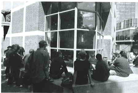
FOR THEIR PERFORMANCE, We Come From Your Future , sound art and activist collective ULTRA-RED collaborated with the anti-racist organisation The Monitoring Group to present a sound investigation into the future of anti-racism in the UK. The audience had the opportunity to contribute statements and to listen to invited speakers, including people who have been involved in the anti-racism movement for many years and those who have recently experienced racist violence, as well as participants in The Monitoring Group's 'Rural Racism' project, based in southwest Britain. The statements, written in the participants' different languages, were mounted on the wall after the discussions, forming a multilingual collage.