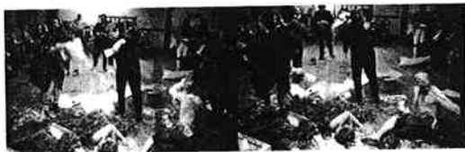
OTTO MÜHL and HERMANN NITSCH of the Viennese Actionists performing Ten Rounds for Cassius Clay at the Destruction in Art Symposium , 13 September 1966.

THE TERMS 'MODERN', 'POSTMODERN' OR 'ALTERMODERN' do not define styles (save as ways of thinking), but here represent tools allowing us to attribute time-scales to cultural eras. In order to understand why the collapse of the globalised financial system in Autumn 2008 appears to mark a definite turning-point in history, it is necessary to re-examine modernism from the point of view of world energy consumption.