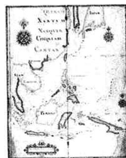
A MAP OF AN EAST INDIAN ARCHIPELAGO FORMATION, made by Nicholas Comberford and published in London in 1665. Collection of the National Maritime Museum, London.