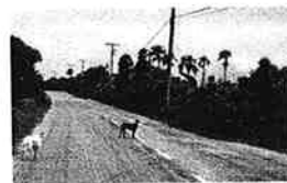
TACITA DEAN, Bubble House (with Dogs), 1999

For sociologist Marc Augé: ‘Culture has never been a spontaneous product that any one territory could appropriate. This illusory definition resurfaces today because there no longer is any territory. It is one of the illusions maintained by globalisation. Contemporary art acquiesces in this ambivalence, even when seeking to make it its subject.’ 16 In a world every inch of which is under satellite surveillance, territory takes the form of a construction or a journey.