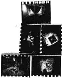
[TOP] ROBERT SMITHSON, Asphalt Rundown , Rome 1969, 1969 [BELOW] GORDON MATTA-CLARK, Rendez-vous, Sous-sol ( Descending Steps for Batan ), 1977, views of the project site under Yvon Lambert Gallery, Paris.

I wrote earlier that postmodern culture had its roots in the idea of the end of history; more precisely, it posits the end of history considered as a linear narrative . In this respect, Lyotard defines the postmodern as the end of 'grand narratives', future scenarios that history is fated to fulfil, like a film-maker following a pre-defined script. The disappearance of these 'metanarratives' (Marxism, in particular) ushers in a culture of improvisation and time-loops: if there is no more script, we have henceforth to react to a 'context', or deal in short-term measures. Forms are no longer indexed to a narrative defining them as belonging to precise historical moments, but rather embedded in the 'text' of culture, with no reference save to themselves. Palimpsests, pastiches, textuality... Signs have lost all contact with human history and are self-generating in an infinite Brownian motion, a labyrinth of signs.