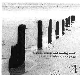
COVER OF THE 2002 edition of W.G. SEBALD's The Rings of Saturn , a book that provided one of the important starting points for the conception of the exhibition.