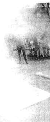
[TOP] GUSTAV METZGER, Acid Action Painting , Nylon, hydrochloric acid, metal, South Bank Demonstration, 3 July 1961. [BOTTOM] PRO-DIAZ producing Painting with Explosion at the Destruction in Art Symposium , 1966, organised by Gustav Metzger.